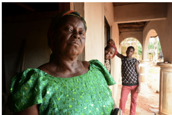
FROM A ROCK TO A HARD PLACE