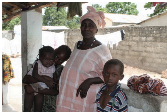
TAKING THE 'BACK WAY' OUT OF GAMBIA