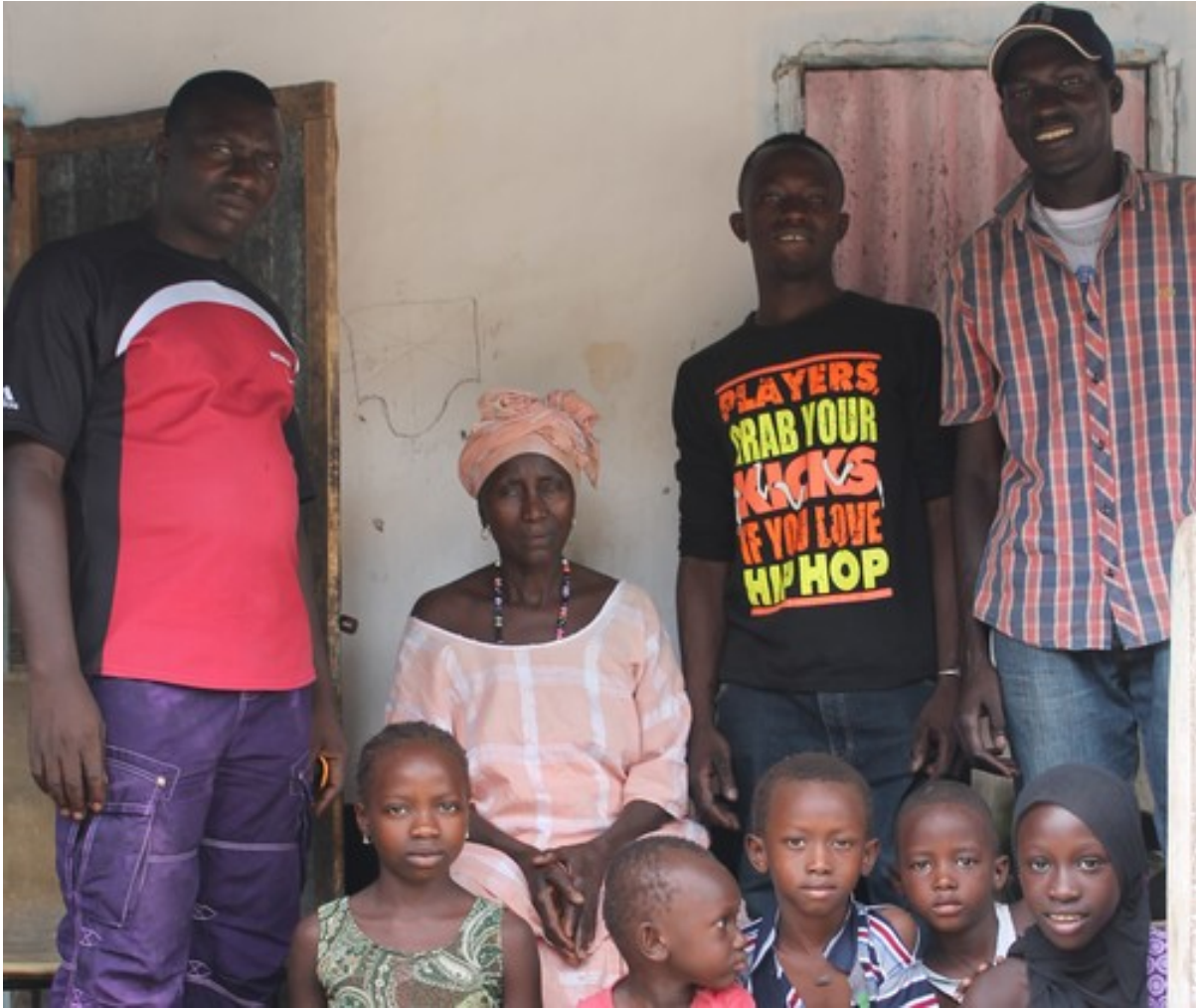
Home front - Brikama

Inside their dingy home, the plasterboard walls are crumbling and the floors are bare concrete, save for patches of worn lino. A battered wooden dresser is the only item of furniture in the living area.