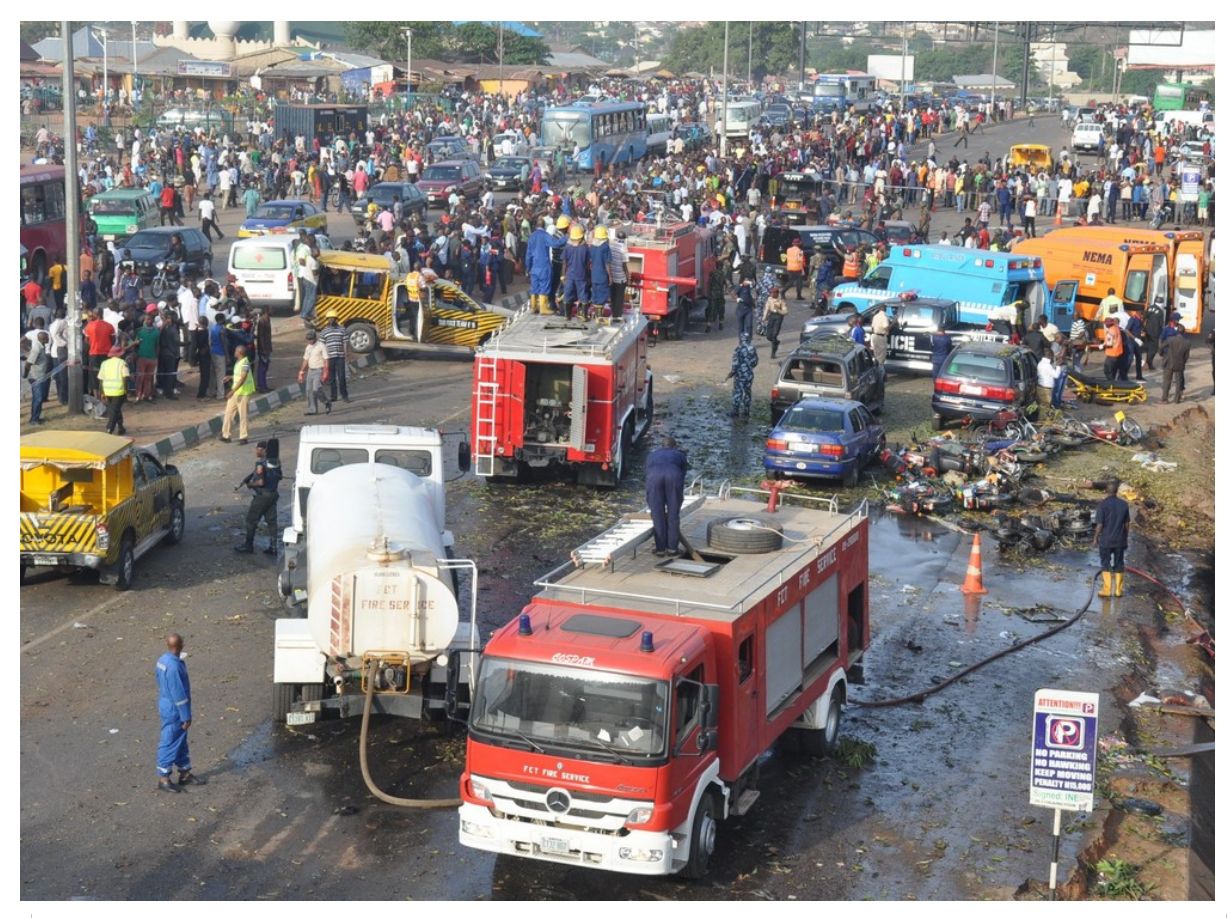
Aftermath: 75 people died in Boko Haram's bombing of the Nyanya bus park in Abuja, April 2014